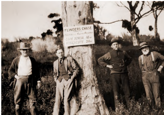
Flinders Chase Fauna and Flora Reserve, c1920 [SLSA B 49875]

For all the latest information, go to our website where you will find details of speakers and visits, along with information about our publications and a subject index for articles published in the Journal from 1975 to 2002.