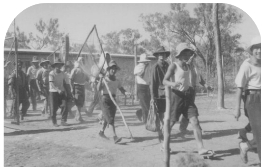
Japanese fishing group leaving the compound, Woolenook Bend, 1944.

Full details, including itinerary, costs, and departure points will be published in our History SA newsletter and on our website. Bookings are essential, and you are more than welcome to invite friends!