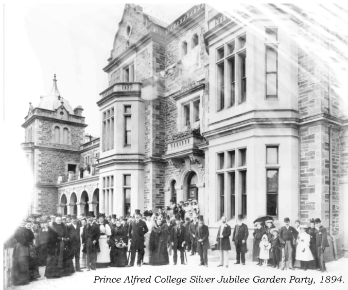
Prince Alfred College Silver Jubilee Garden Party, 1894.

Membership fees can be paid in person at a meeting by cash, or by posting a cheque or money order; we do not recommend sending cash in the post. If you pay by credit card, please kindly add $2 to your subscription to cover the bank fee charged to the Society. We only accept VISA or Mastercard. Alternatively, you can pay by EFT: please include your surname and initials as the payment reference.