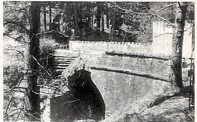
Deep Creek bridge before restoration.

'I encourage readers of History SA to visit the site to view both the beautiful setting and the restoration work. The area will be signposted and access will be on foot only. The bridge is just as hard to reach now as it was in the 1860s, so wear your walking shoes!' he warned.