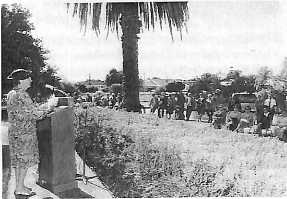
Pictured is the Governor Dame Roma Mitchell addressing the gathering at the 200th birthday celebrations of Captain Sturt at 'The Grange' on 28 April this year.

In August 1844 Sturt left 'The Grange' on his Central Australian expedition and returned in January 1846 after exploring some of the most inhospitable parts of the interior. He reached to within 150 miles of the geographical centre of the continent and endured great suffering with heat, drought and scurvy.