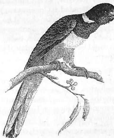
The Port Lincoln Parrot ( Platycercus zonarius ) shot by Robert Brown on SA territory in 1802. From the zoological drawings of F.L. Bauer, British Museum.

Today, that special factor is largely absent. Not only are Rafflesia facing extinction but the Sumatran subspecies of Asiatic elephant is rare and endangered; just two organisms of many thousands which are falling before human encroachment.