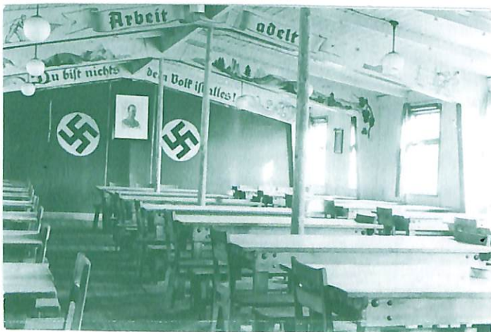
Scene from the Wolfsberg POW camp in Austria.