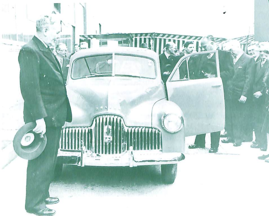
Left, Prime Minister Chifley after unveiling the original model to the Australian public at the GMH plant in Fishermans Bend, Melbourne, on 29 November 1948.