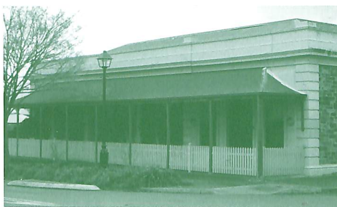
Hughes Butchers Shop, where you could also catch a cab