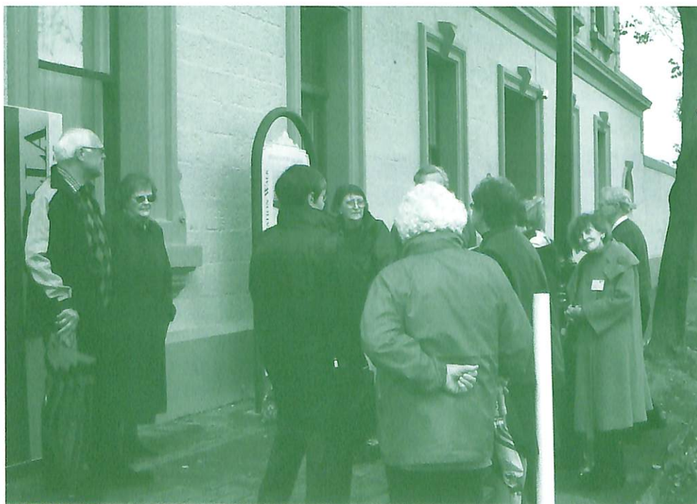
Members outside the Rising Sun Inn.