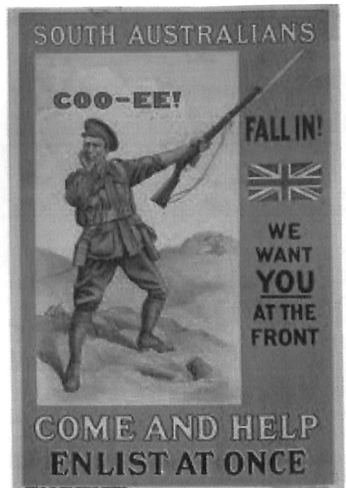
World War One enlistment poster.