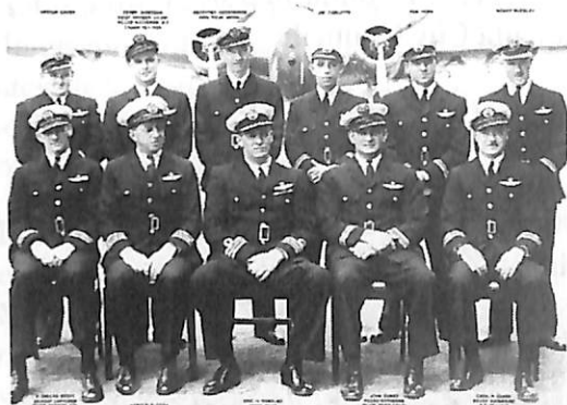
Guinea Airways Pilots - 1938

The Adelaide area has had an interesting spread of aviation since 1871, starting with Tom Gale's balloon. He flew in it from the sheep and cattle markets near the corner of North and West Terraces Adelaide, to a point some twelve kilometres northeast.