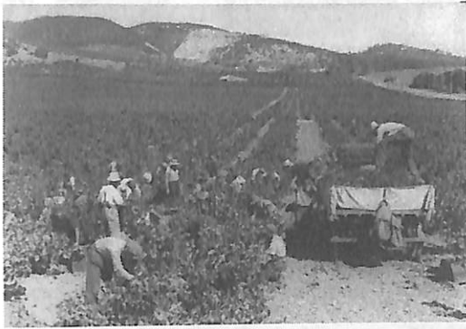
Grape harvest at Penfold's Grange Vineyards, Magill in the early 1950s (Stonyfell Quarry is in the background)

For our end-of-year, Christmas event we will be visiting Penfold's Magill Vineyards on Sunday 24 th November 2013 at 2pm.