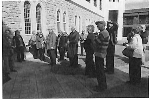
Visit to St Dominic's Priory College, 13 August.