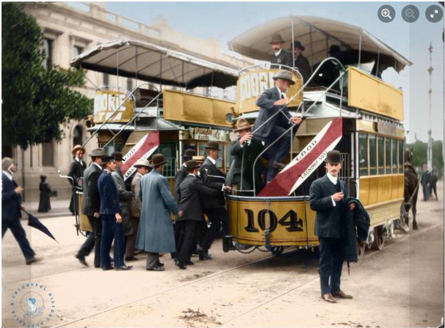
Wakefield Street Trams 1909. SLSA B4396 Adelaide was the first Australian city to have a permanent tramway system when the Adelaide & Suburban Tramway Company opened the Kensington-City line.