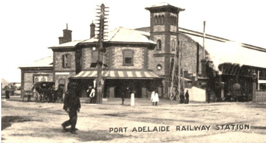
Port Dock Station 'before 1927'.

This was the original Port Adelaide station which opened in April 1856. Later, in 1916 a new station was built on Commercial Road and became the main Port Adelaide Railway Station, and this became known as 'Port Dock' (it was eventually demolished)