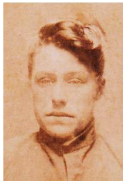
Frances Knorr, c. 1892-1894

Information about her once model domestic left her in disbelief and horror, for she was none other than the notorious Melbourne 'baby farmer' Frances Knorr, whom the police were trying to track down while she was hiding out in Adelaide. Events in Melbourne moved pretty fast once Minnie/Frances was arrested, brought to court and convicted. Within 18 months, on 15 January 1894, she was hanged in Melbourne for murder for killing one child, confessing to two others, and was suspected of disposing of a dozen more infants.