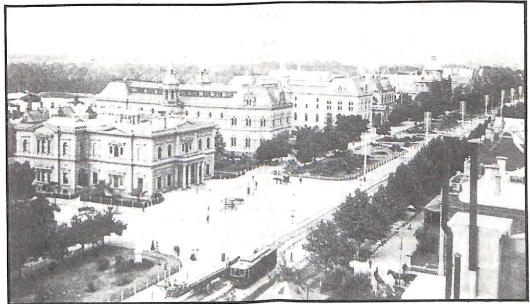
North Terrace in an earlier age.