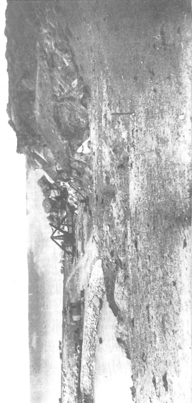
The Granite Island breakwater in the course of construction, 1881. When completed a year later it was 1,000 feet long, one third of the length recommended by engineers to secure the expansion of the Port Victor anchorage.

During the first three months of the present year about 21,000 bales of wool were sent over the Goolwa line, so that the total for the year will probably be very much higher than that of last year. For the season of 1882-83 about 31,750 bales were shipped from Port Adelaide and Port Victor, the destinations and quantities being approximately as follows:- To London direct via Port Adelaide, Darling wools, 2,000 bales; to Melbourne, Darling wools, 9,300; to London direct, from Port Victor, Lake and Lower Murray wools, 4,700 bales; Darling wools 15,750. It is impossible to follow all the wool received, as portions of it get into the hands of local fellmongers, and are often not shipped for some time; but the figures given above show from another point of view the rapid